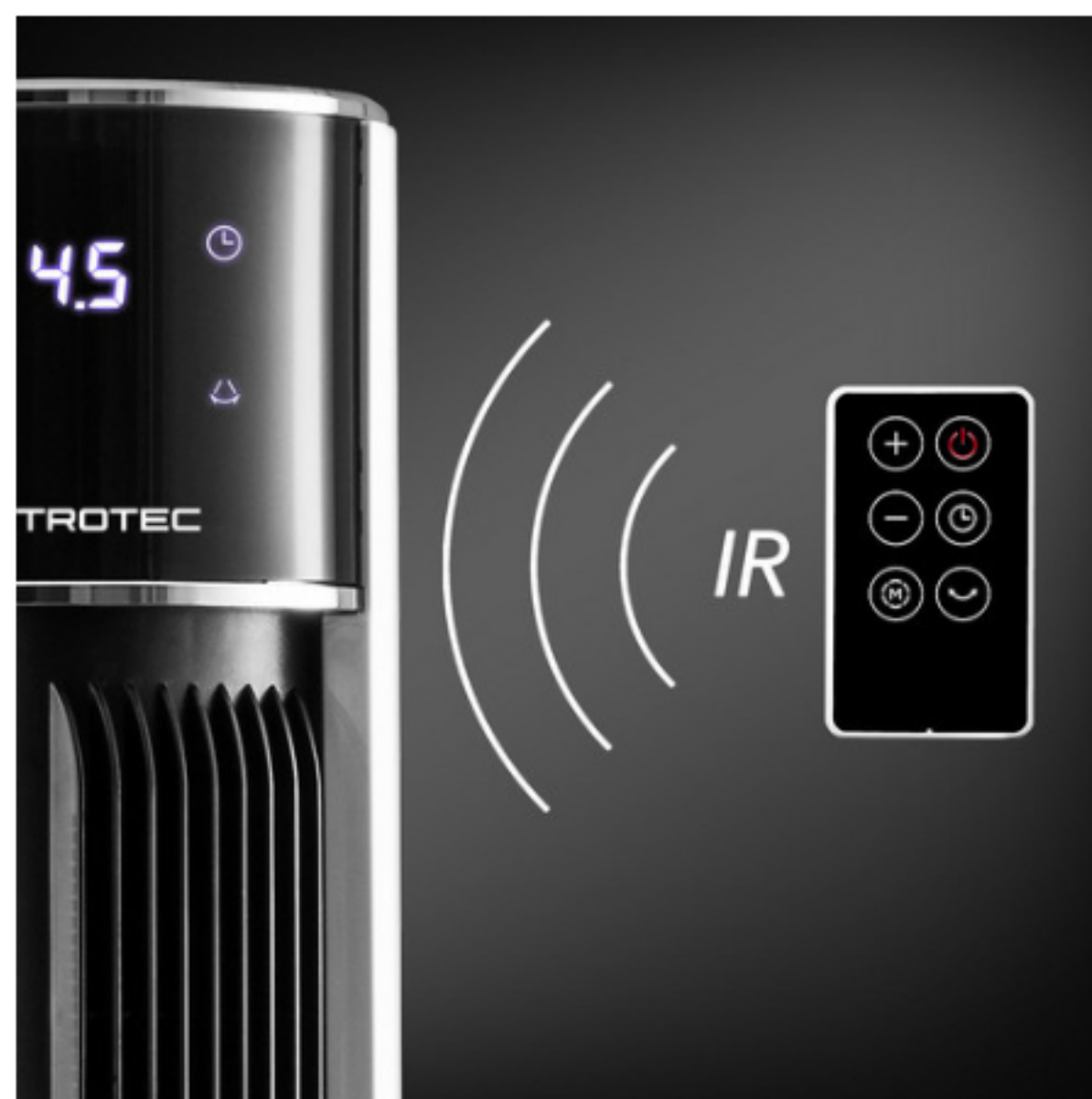
Conveniently control all functions of the TVE 39 T by means of the slim infrared remote control.