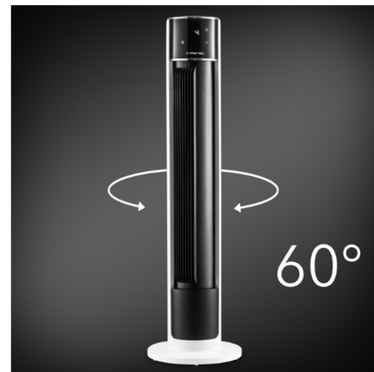
The automatic, on-demand 60° oscillation distributes the fresh air evenly and effectively in the room.