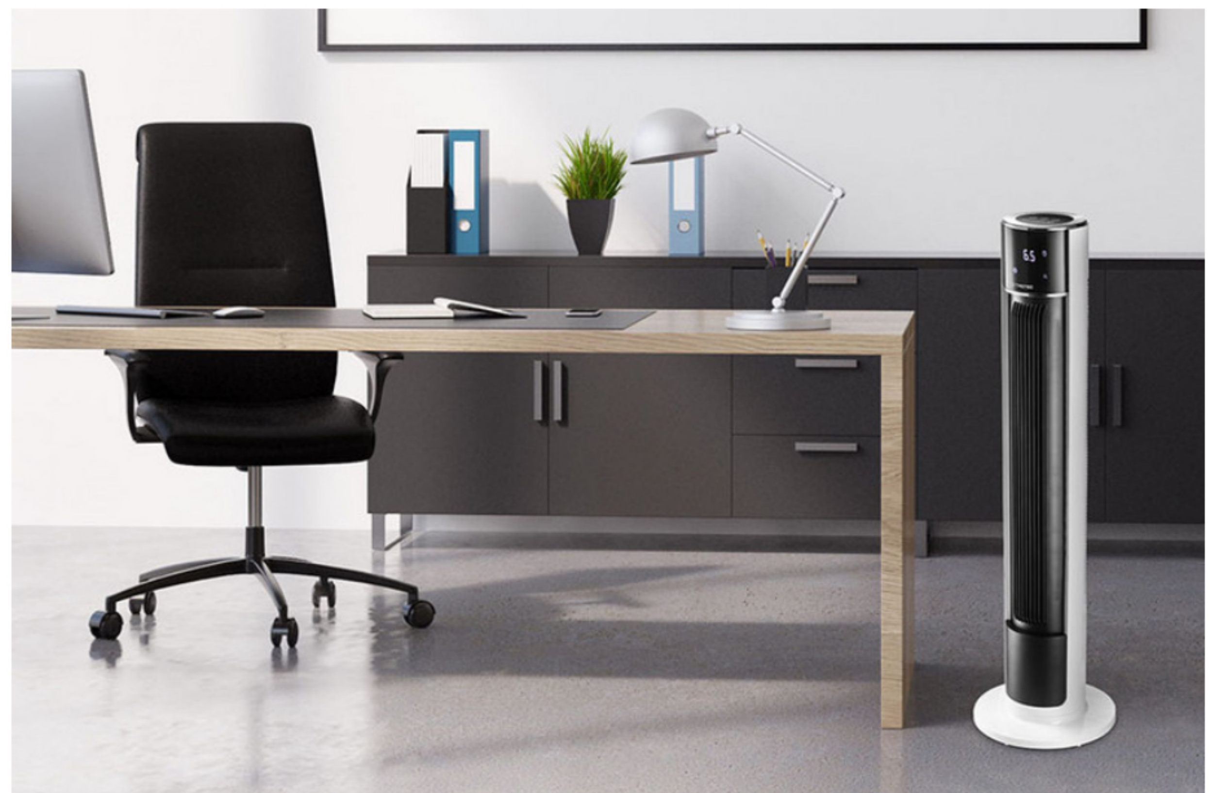
Stay fully focussed and productive at work. On hot days, the stylish TVE 39 T brings soothing refreshment and a welcome breeze to your office.