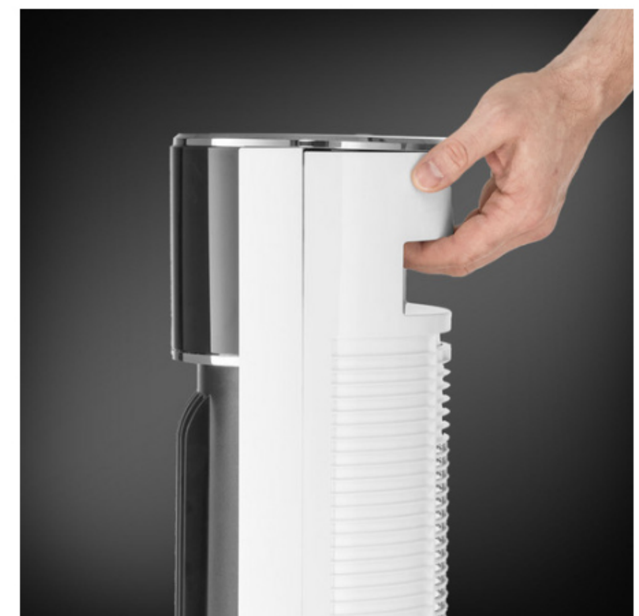
Convenient, handy and light with only 5,500 g: Owing to the recessed handle the TVE 39 T can be repositioned fast as the wind.