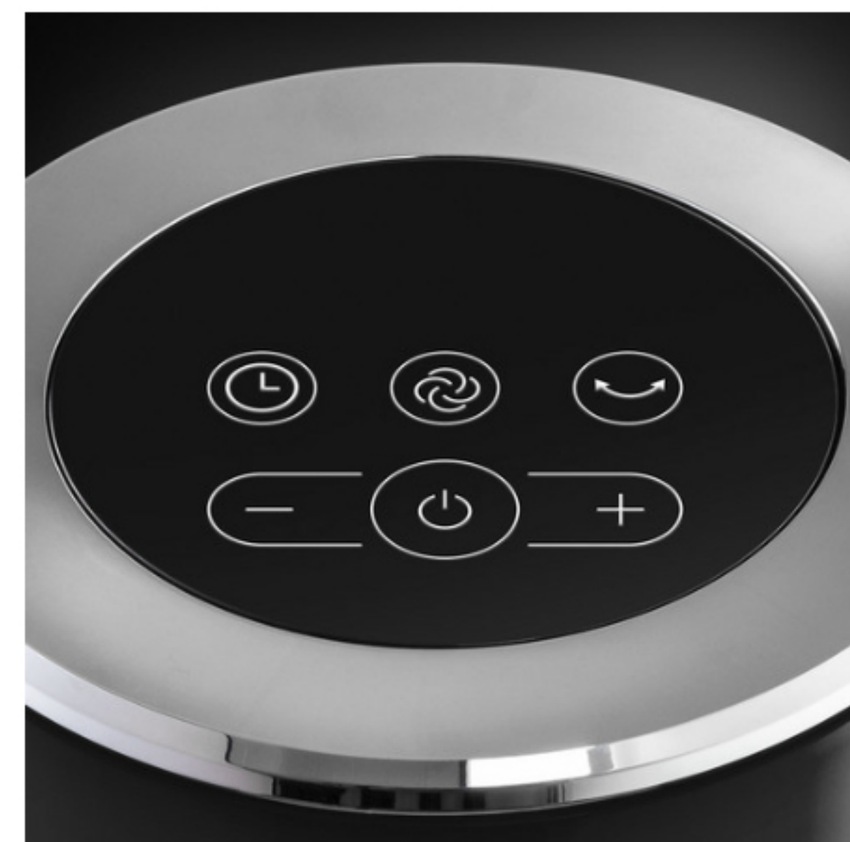
All the settings can also be made intuitively using the buttons neatly arranged on the control panel.