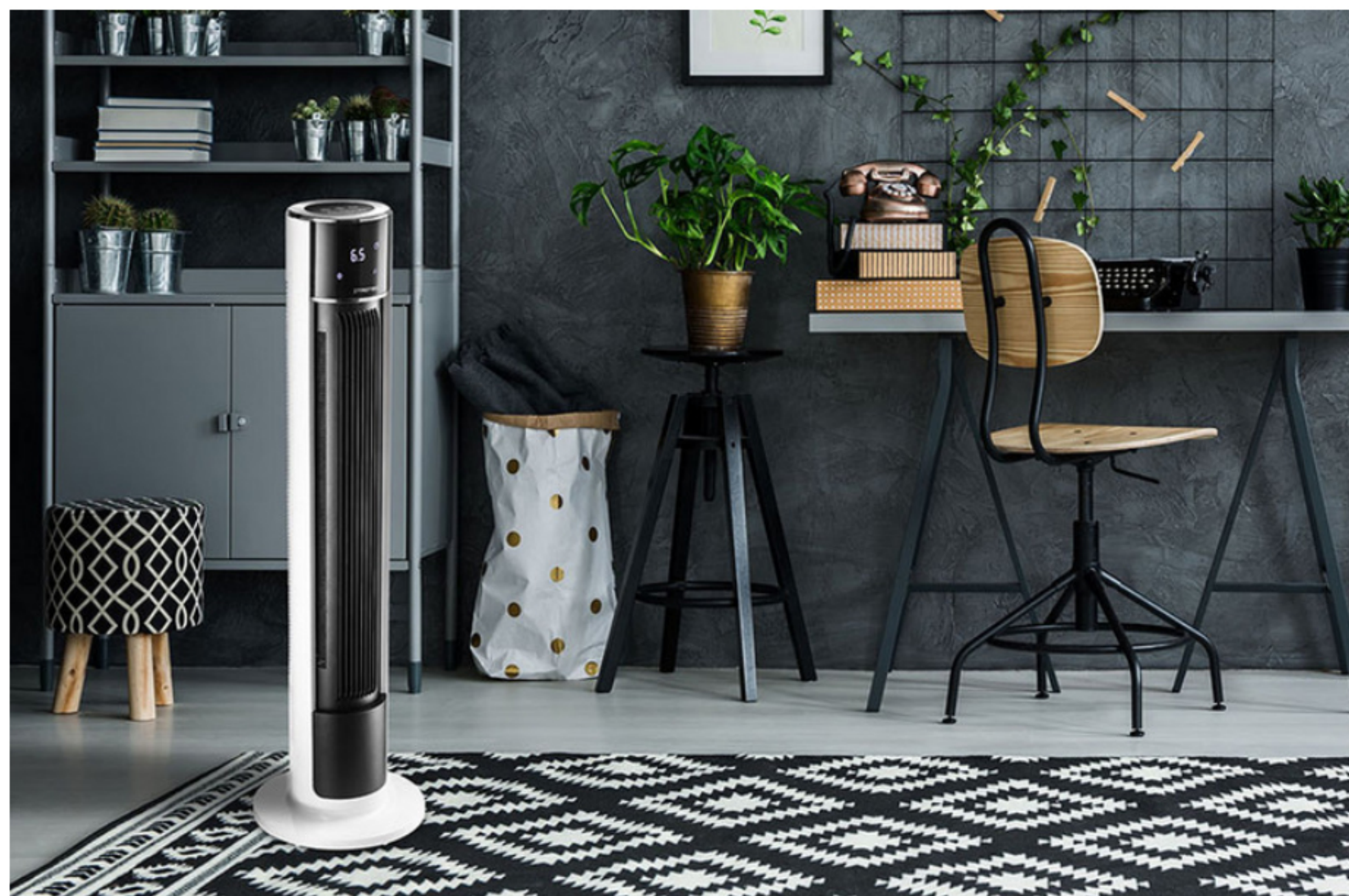
Whether in living spaces or in the bedroom – the TVE 39 T introduces fresh air and cool looks to the room.