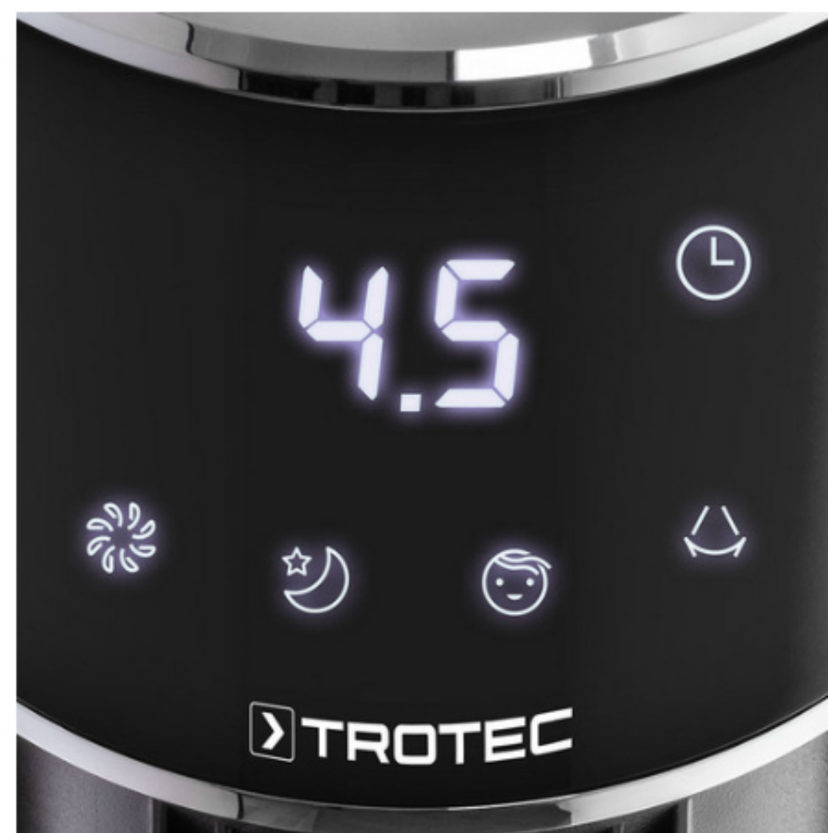
The modern LED display indicates the selected operating mode and the set parameters. For the purpose of visualization the above illustration depicts all the existing display icons at once.