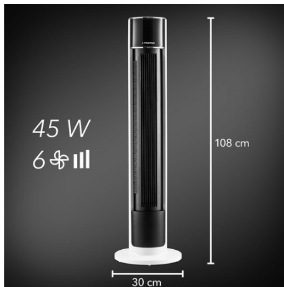
Compact dimensions: the designer tower fan TVE 39 T is 108 cm high and 30 cm wide. It comes with 6 speed levels and 45 watts of power.