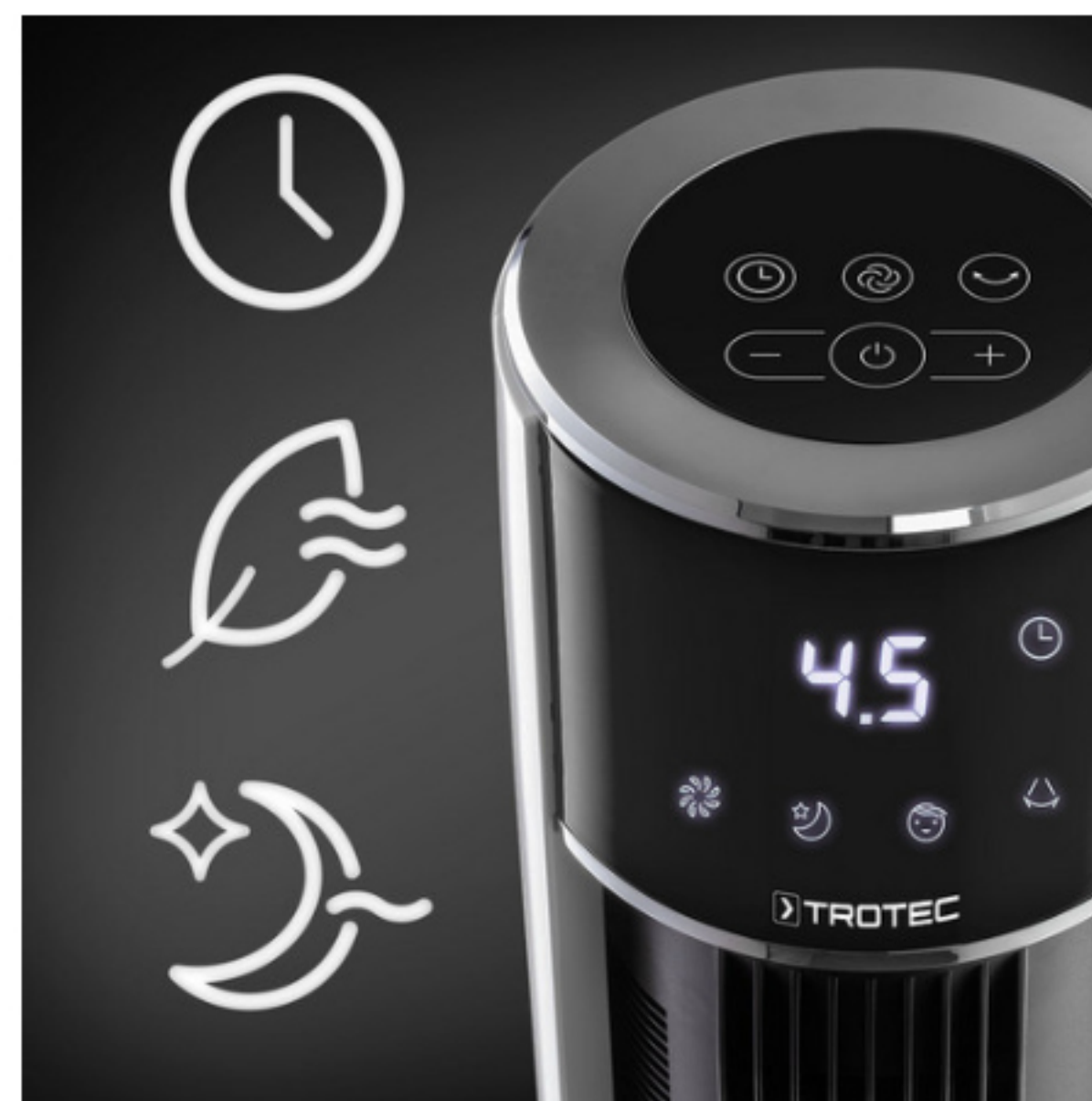
With features such as time-controlled switch-on and -off, natural wind function and night mode this high-quality tower fan offers agreeable and convenient cooling comfort.