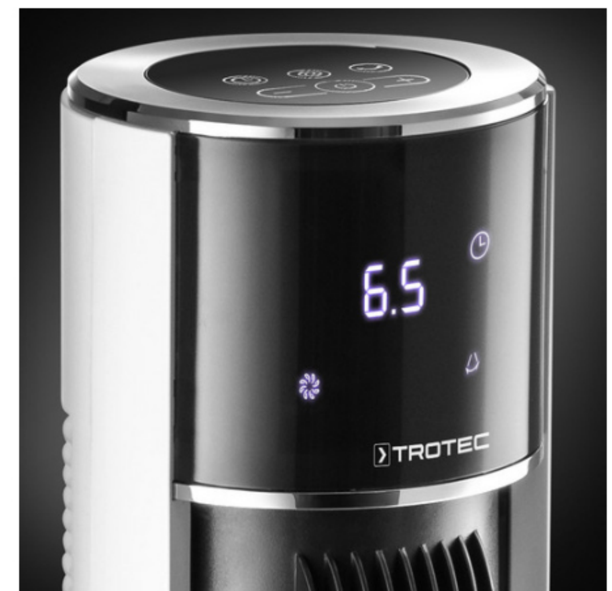
The high-gloss surfaces emphasize the high-class overall impression of the TVE 39 T. The modern design blends in perfectly with your living environment.