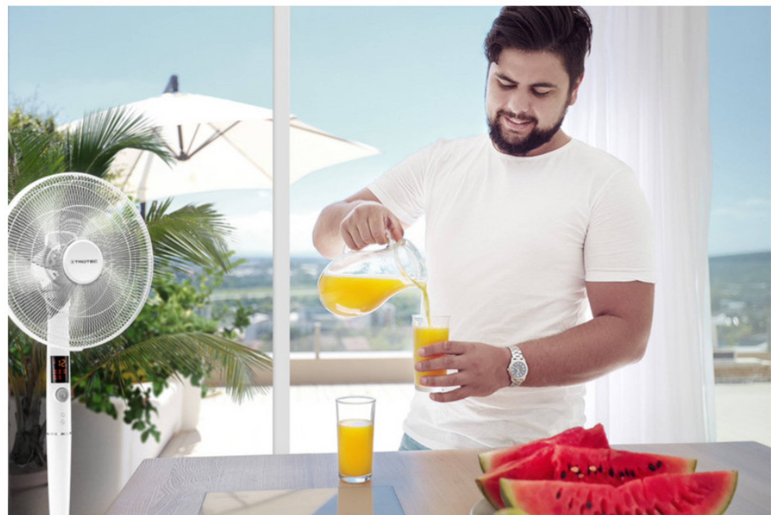
In the summer a fresh breeze can do a world of good – both indoors and on the terrace.