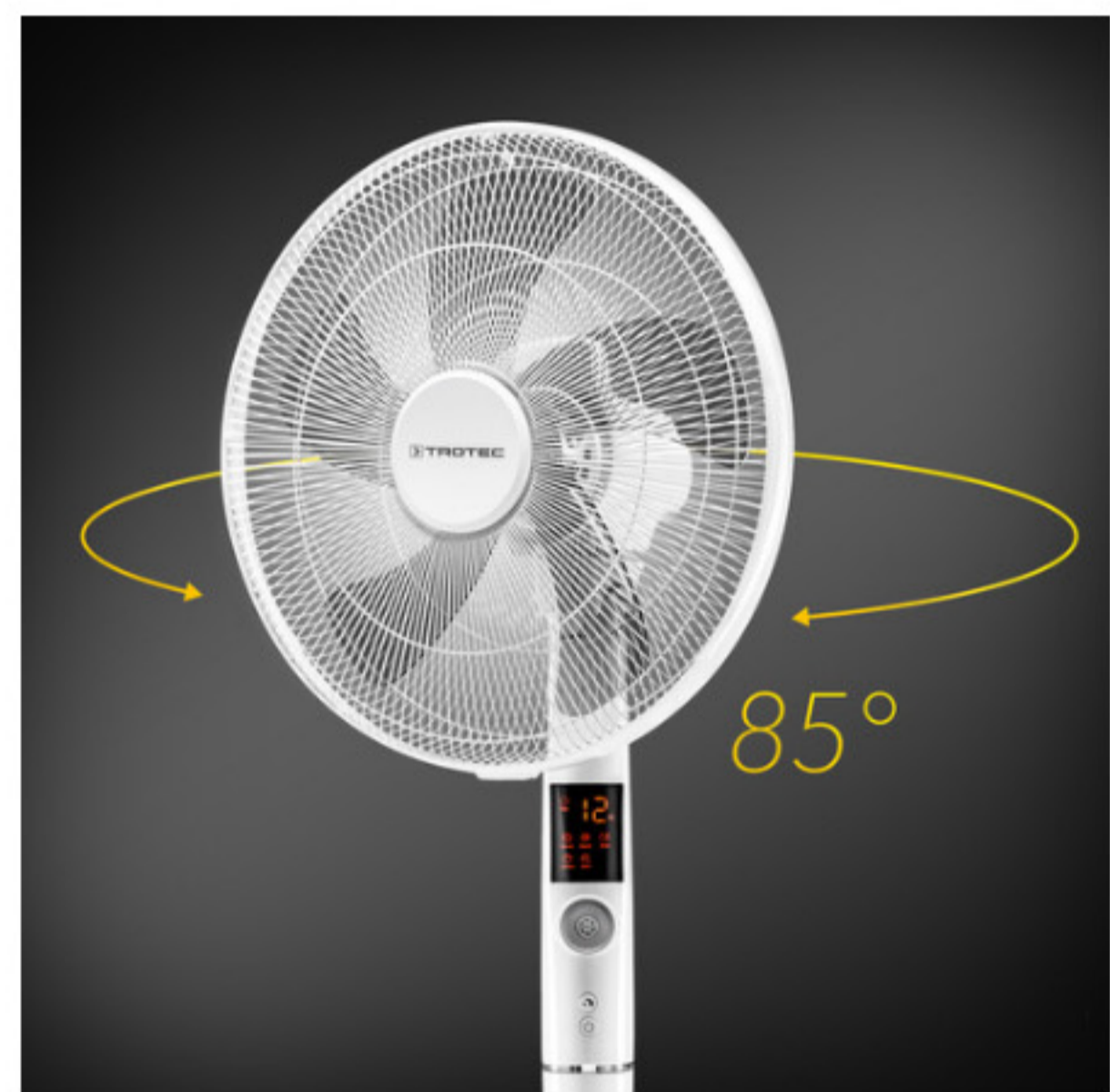
Refreshment reaching every corner: Automatically oscillating by 85° with switch-off function