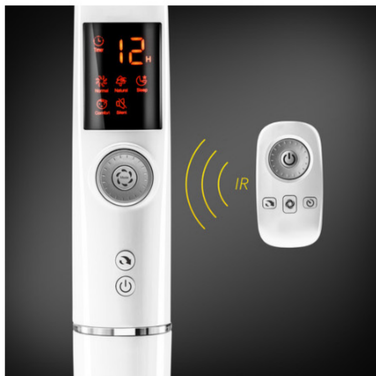
Easy to handle: 5 operating modes, timer function, 26 speed levels and oscillation function.