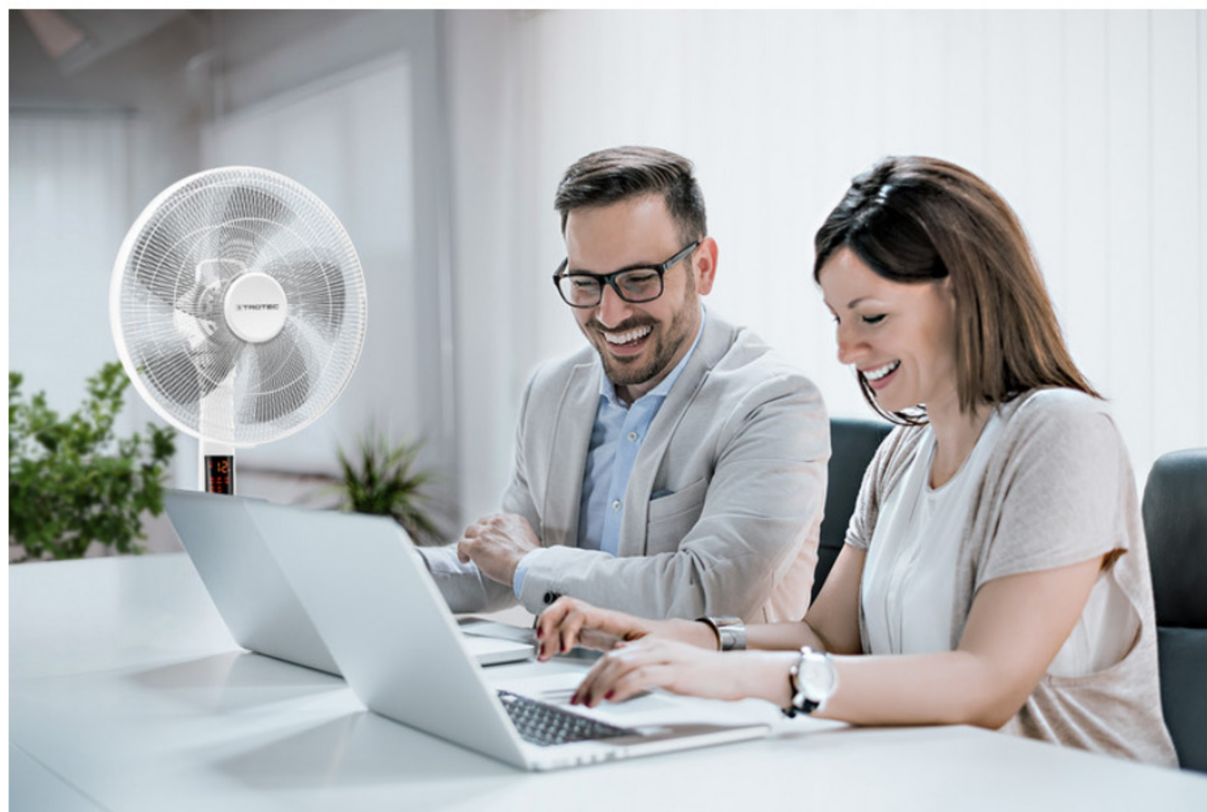
Cooling in style: Deliberate cooling in the office can clear your mind to increase the productivity.