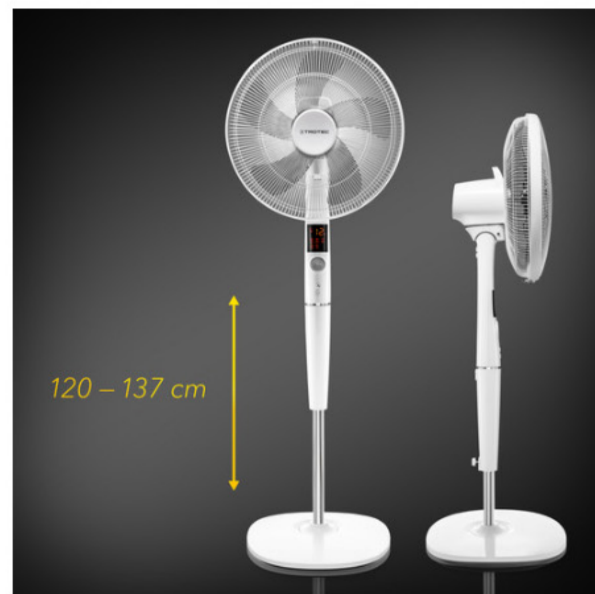
Flexibly adjustable: Infinitely variable height adjustment between 120 and 137 cm. Eye-catching: The high-grade exterior of the pedestal fan TVE 26 S adds fresh highlights to the room